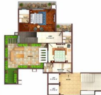
Penthouse Upper Floor