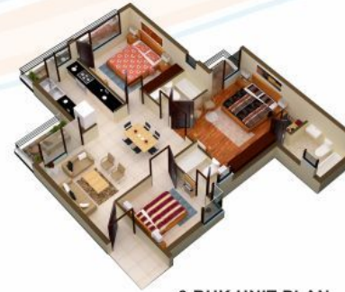
3 BHK UNIT PLAN (1650 Sqft.)