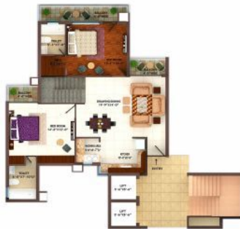
Penthouse Lower (3220 Sqft.)