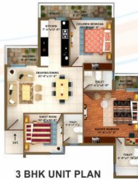
3 BHK UNIT PLAN (1650 Sqft.)