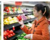
Convenience Shop For Daily Need